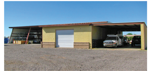
Shop is approx. 7800 sq. ft.