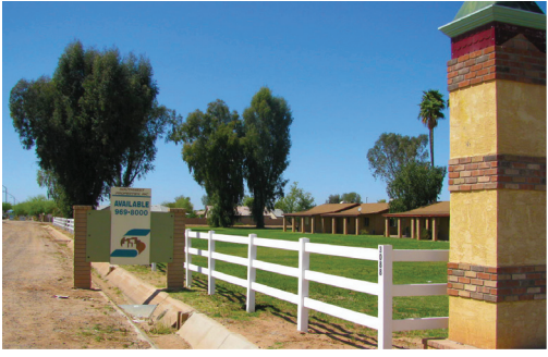
Property fronts Williams Field Rd.