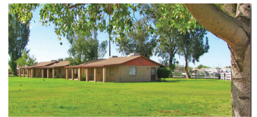
2 duplex buildings approx 1500 sq. ft. each

Property Features: Approx. 5 ac chain-link fenced, gravel yard with large asphalt pad.