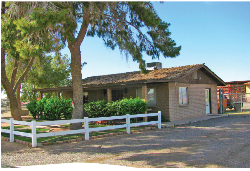
Office approx. 960 sq. ft.